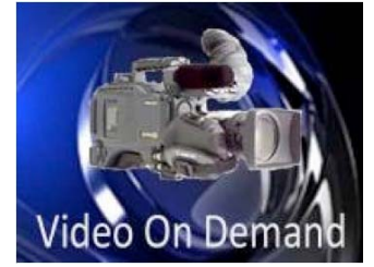
Video On Demand